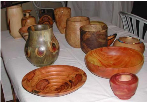
Some of the items on the Instant Gallery