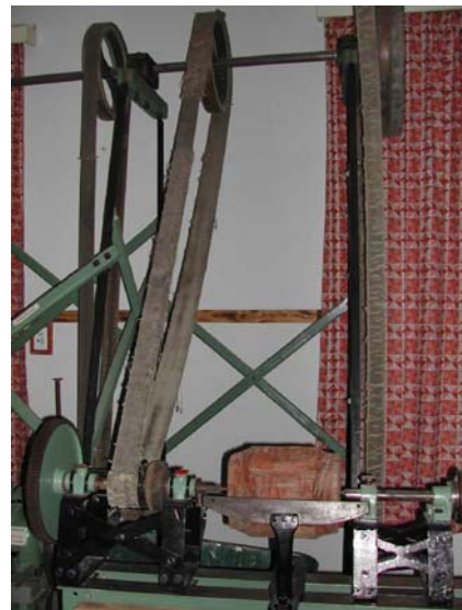
An old wagon-maker's lathe