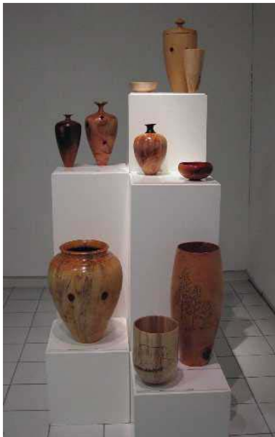
Some of the pieces at ArtB in Bellville