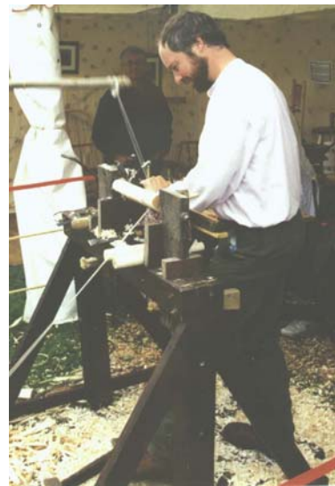
A turner in Ireland making Smoker's Chairs using a pole lathe.