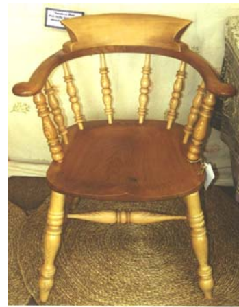
A Smoker's Chair made using non-mechanical tools. (See Mike Bester's article.)

The countdown to the East London Seminar is in its throes of the last two weeks, with much anticipation for the event, coupled with high expectations for the activities around the visit of Phil Irons next weekend, here in Cape Town.