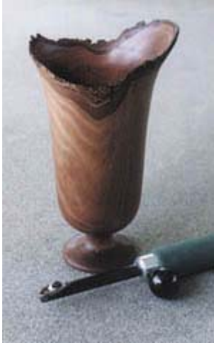
THE MUNRO HOLLOWER

After the “tools and tips” demonstration at last month’s meeting, I was inspired to include the article below, on the Munro Hollower. There has been much debate on the virtues of the ring tool amongst our members, and the comments by the author of the article had a familiar tone, so enjoy the “test report”.