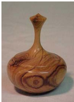
Box in Wild olive

NB Remember to bring your own chisels and other accessories for the 'working' Wednesdays.