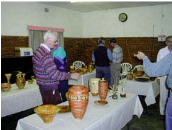
Some items from the last Club Showcase, on 19 th November 1999.

The next formal meeting will be Wednesday 21 st June, 19:00 sharp, at the Hobbies Club, Pinelands, as usual.