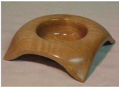
An unusual "floating" bowl