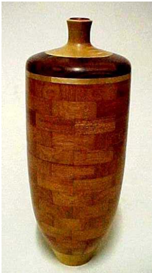
One of Thys's Segmented vases

The advantages are that you can make a stunning piece, literally from offcuts. You can make a fair sized bowl out of one plank of exotic wood. By mixing and matching different woods, odd pieces can be formed into something special.